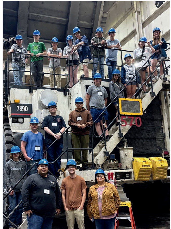
Students pose on one of the massive trucks used at the Freedom Coal Mine.