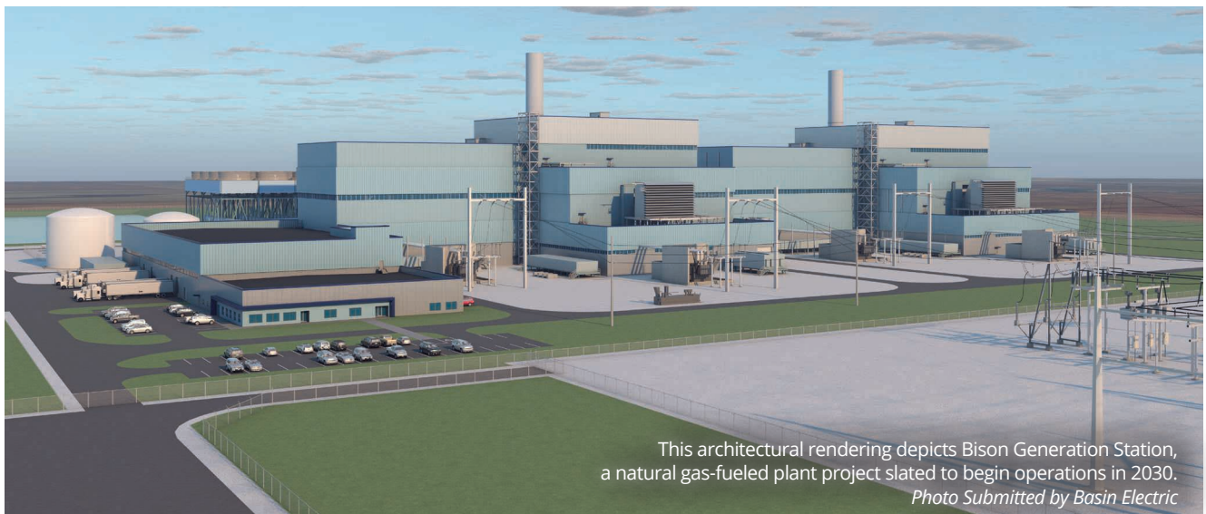
This architectural rendering depicts Bison Generation Station, a natural gas-fueled plant project slated to begin operations in 2030.