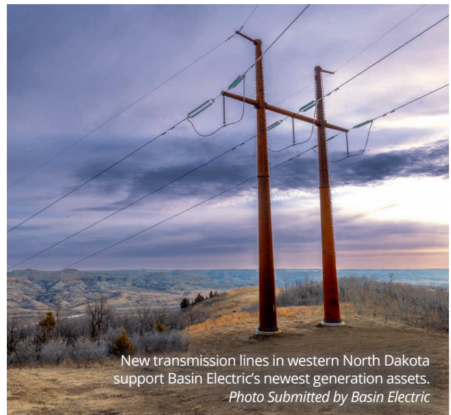
New transmission lines in western North Dakota support Basin Electric's newest generation assets.